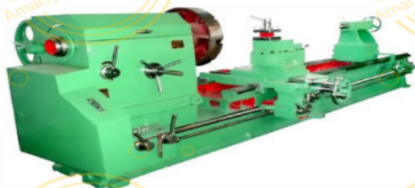
LATHE MACHINE ROLL TURNING PLANNER CENTRE 16" / 18" / 20" / 22" / 24" / 26" / 30" / 34" 406MM / 457MM / 508MM / 559MM / 610MM / 660MM / 762MM / 864MM