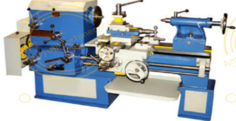
LATHE MACHINE CENTRE 10" 254MM