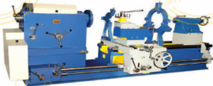
LATHE MACHINE PLANNER TYPE CENTRE 16" / 18" / 20" / 22" / 24" / 26" / 28" 406MM / 457MM / 508MM / 559MM / 610MM / 660MM / 711MM