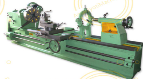
LATHE MACHINE HEAVY PLANNER TYPE CENTRE 28" / 30" / 32" / 34" / 38" / 46" 711MM / 762MM / 813MM / 864MM / 965MM / 1016MM